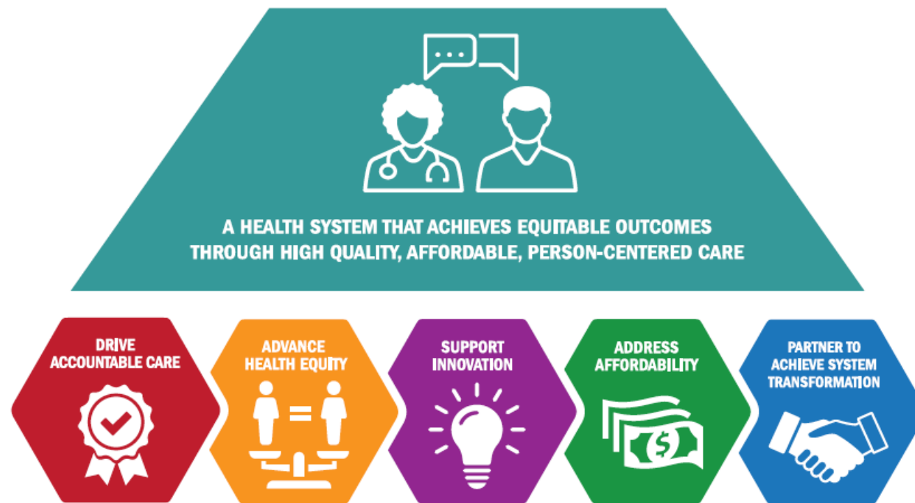
Figure 1. CMS Innovation Center Vision and 5 Strategic Objectives for Advancing System Transformation.

Partner to Achieve System Transformation