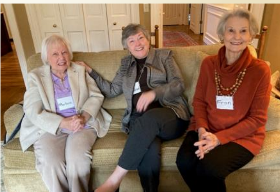
Book Choice Lunch January 2024