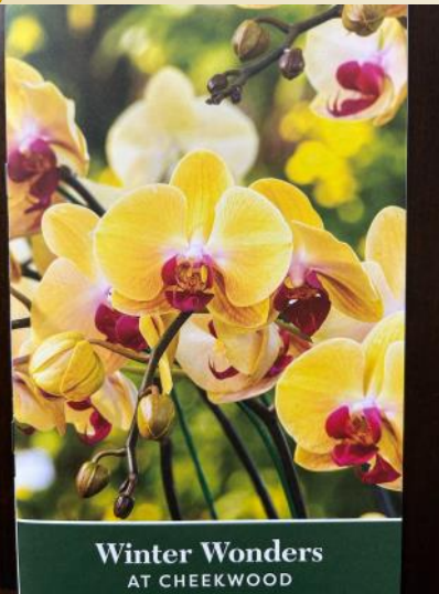
Winter Wonders AT CHEEKWOOD