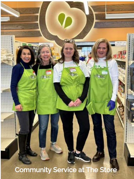
Community Service at The Store