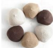
Make A Knocker