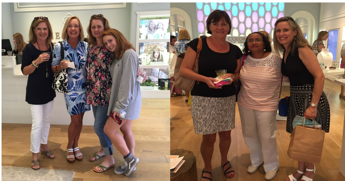
Kendra Scott Fund Raiser left to right