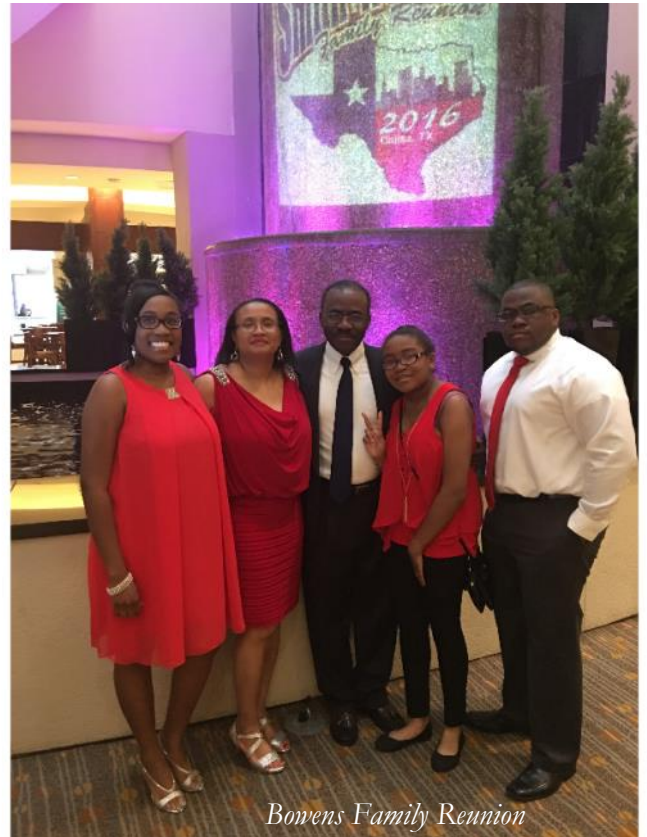
Bowens Family Reunion