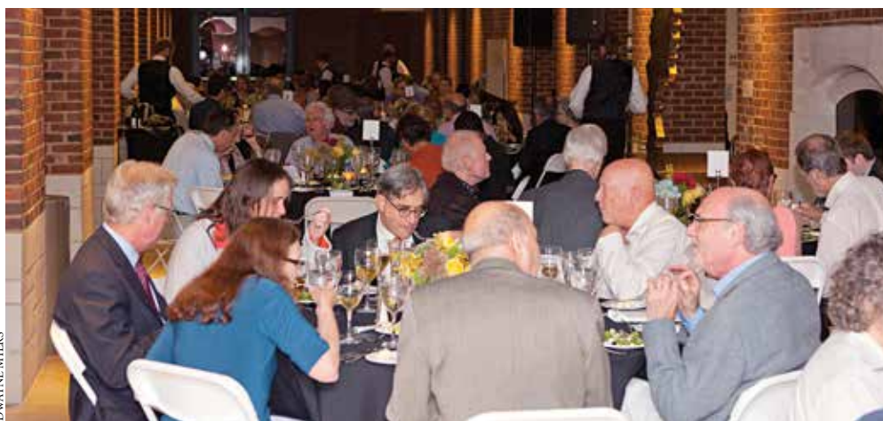
Participants enjoyed a dinner in Vanderbilt's Buttrick Hall following the conference.