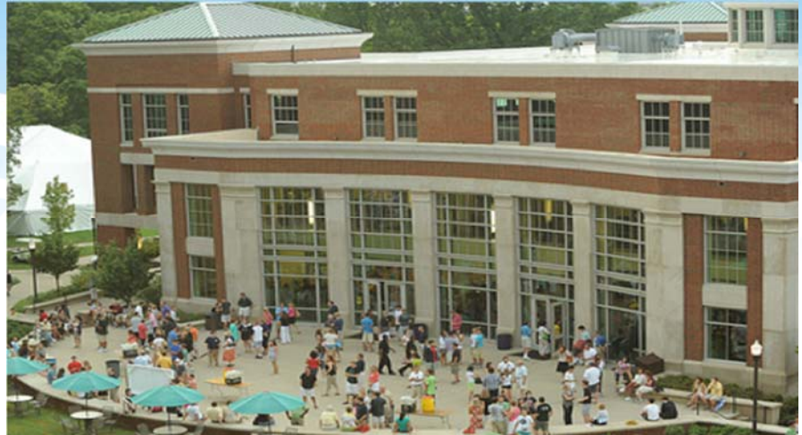
The Martha Ingram Commons Center, home of Vanderbilt's Department of Political Science, during more typical Nashville weather.