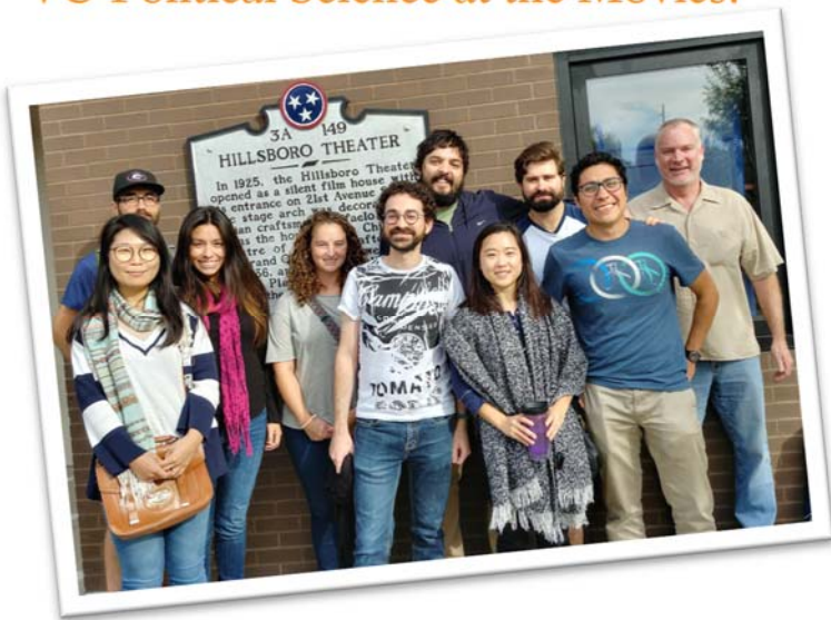
“Who’s got the popcorn?!” PSCI graduate students and faculty outside the beautiful Belcourt Theater following the showing of Human Flow .