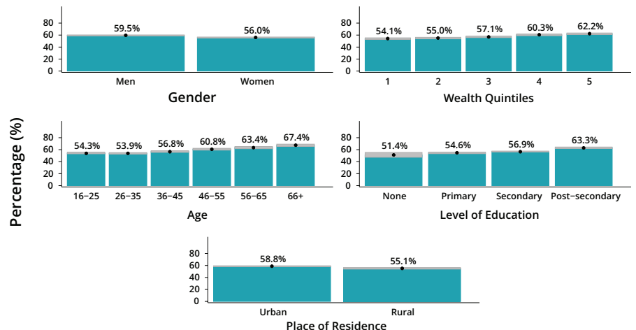
Support for Democracy in the LAC Region, 2018/19

■ 95% Confidence Interval (with Design-Effects)