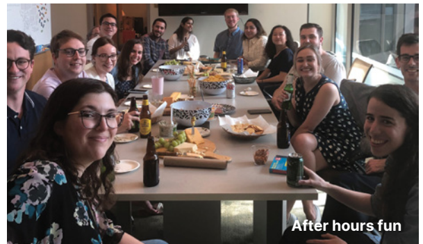
After hours fun