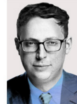
NATE SILVER Author of "On the Edge" American statistician

Tuesday, October 8 5:00 P.M. Student Life Center