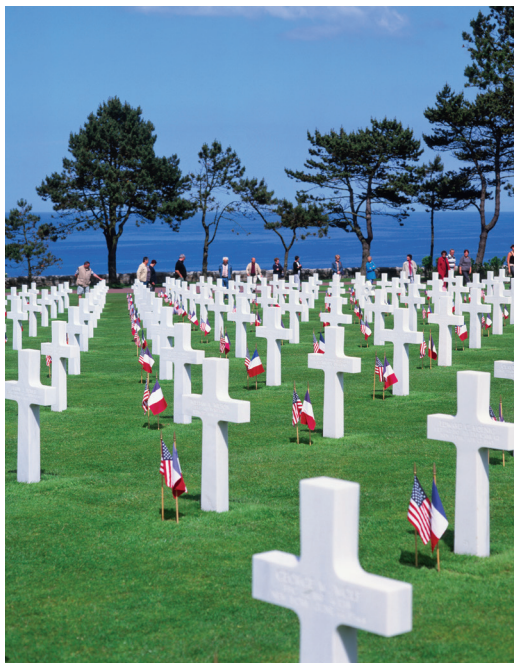
On Day 12, we visit the American Cemetery at Omaha Beach.