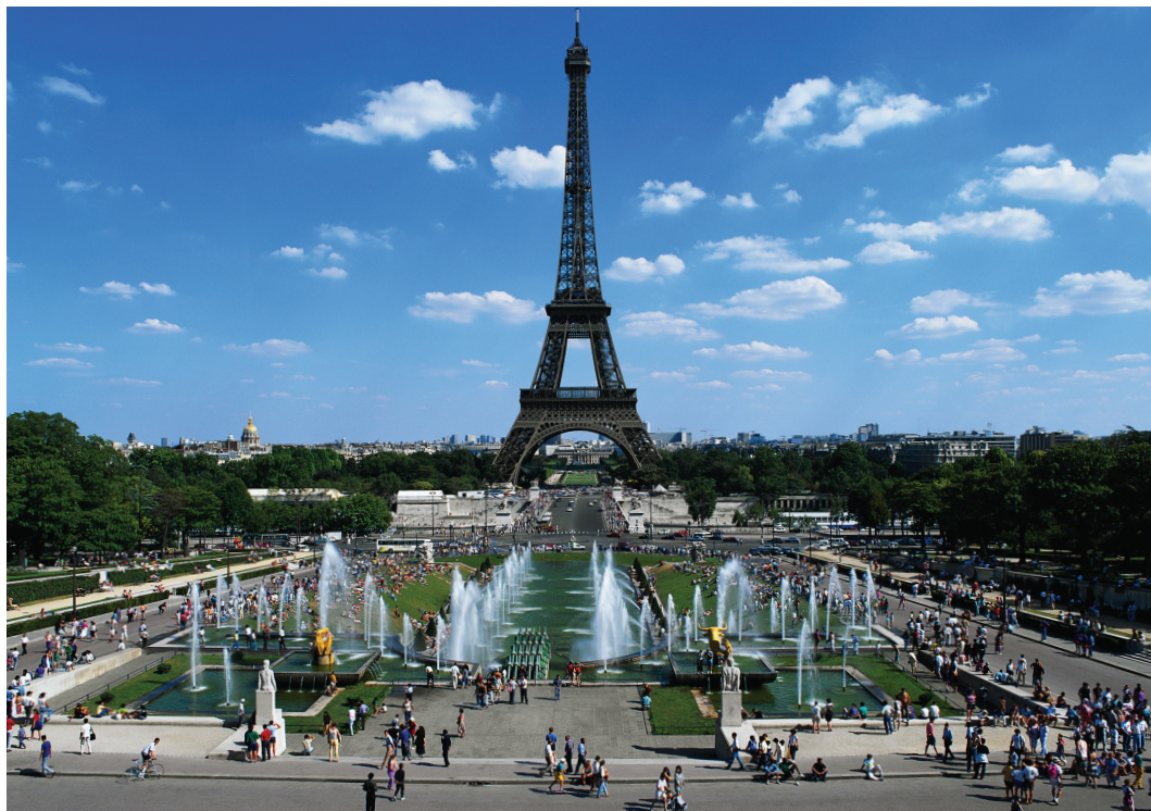
Discover Paris with its iconic Eiffel Tower.

some of Sarlat's museums or art galleries – or simply to wander the atmospheric cobblestone streets. After lunch on our own we visit nearby Rocamadour, a revered pilgrimage site and medieval village whose three tiers cling almost impossibly to a sheer limestone cliff. We take a guided walking tour then enjoy some free time before we return to Sarlat mid-afternoon and dine together tonight. B,D