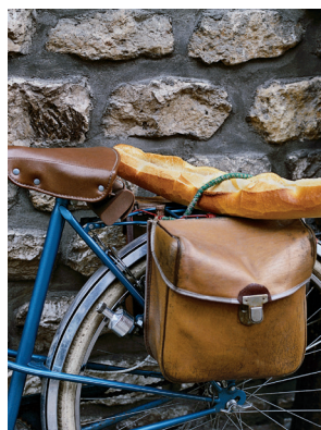
Typical French scene

Day 13: Crépon/Giverny/Paris This morning we visit the village of Giverny and the home and gardens of Impressionist artist Claude Monet. Here we see the familiar lily pond and wisteria-covered Japanese footbridge of Monet's paintings, as well as his home, now restored to its original design. Then we travel to Paris, reaching our hotel late afternoon. We are free for dinner on our own in this culinary capital. B