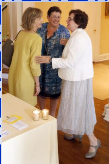
A special VWC welcome