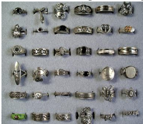
Bill Siesser - Sterling Silver Rings