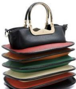
NJS Fashion Handbags