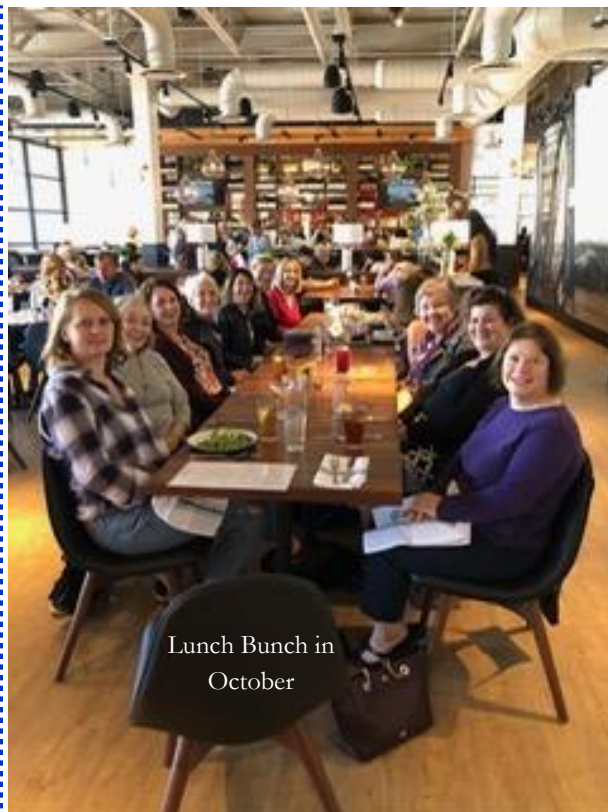
Lunch Bunch in October