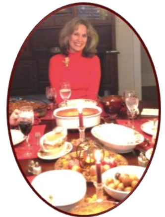
Photo: Last Thanksgiving at the best moment of the day--all the work is finished, the table is full, the dishes are steaming, the family is gathered... and no one is thinking about cleanup yet!