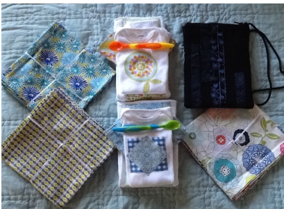
Green Bag Ladies

Vendors accept cash and checks (no credit cards).