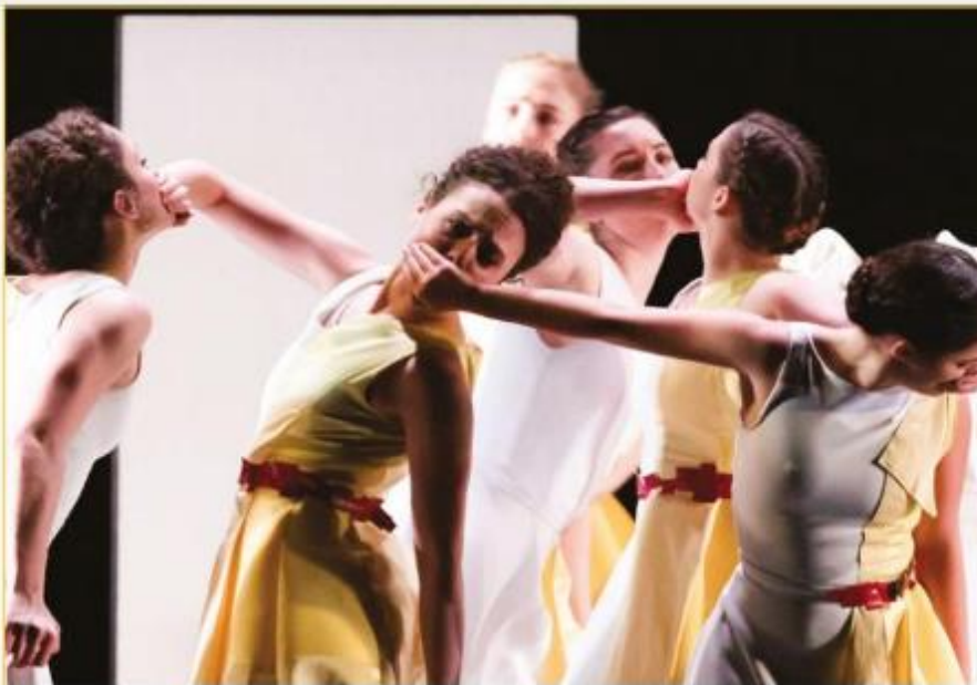
Nashville Ballet releases the digital 72 Steps on Aug. 18.