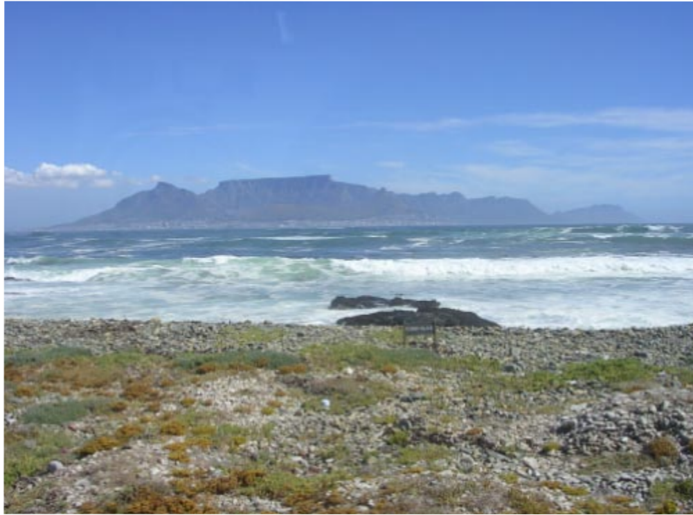
View of Cape Town from Robben Island