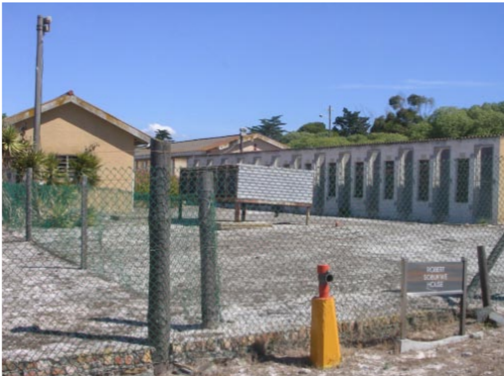
Dog Kennels and Robert Sobukwe House