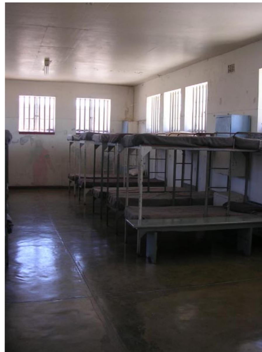
Community Block at Robben Island