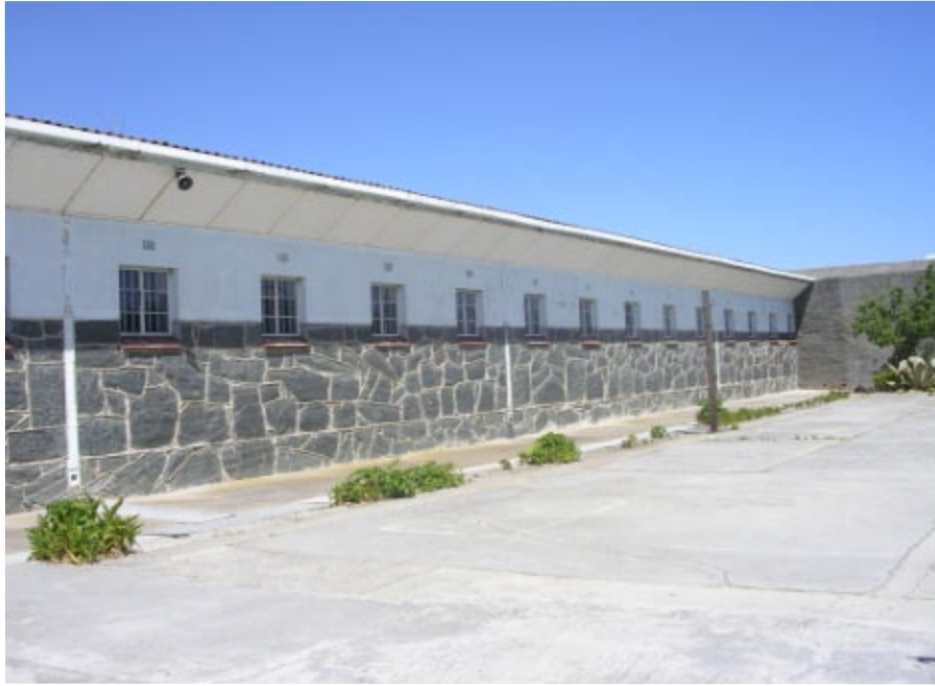
Courtyard Picture at RI Prison