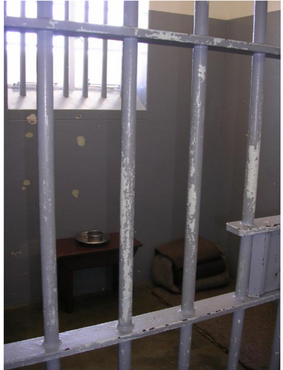
Nelson Mandela's Cell at Robben Island