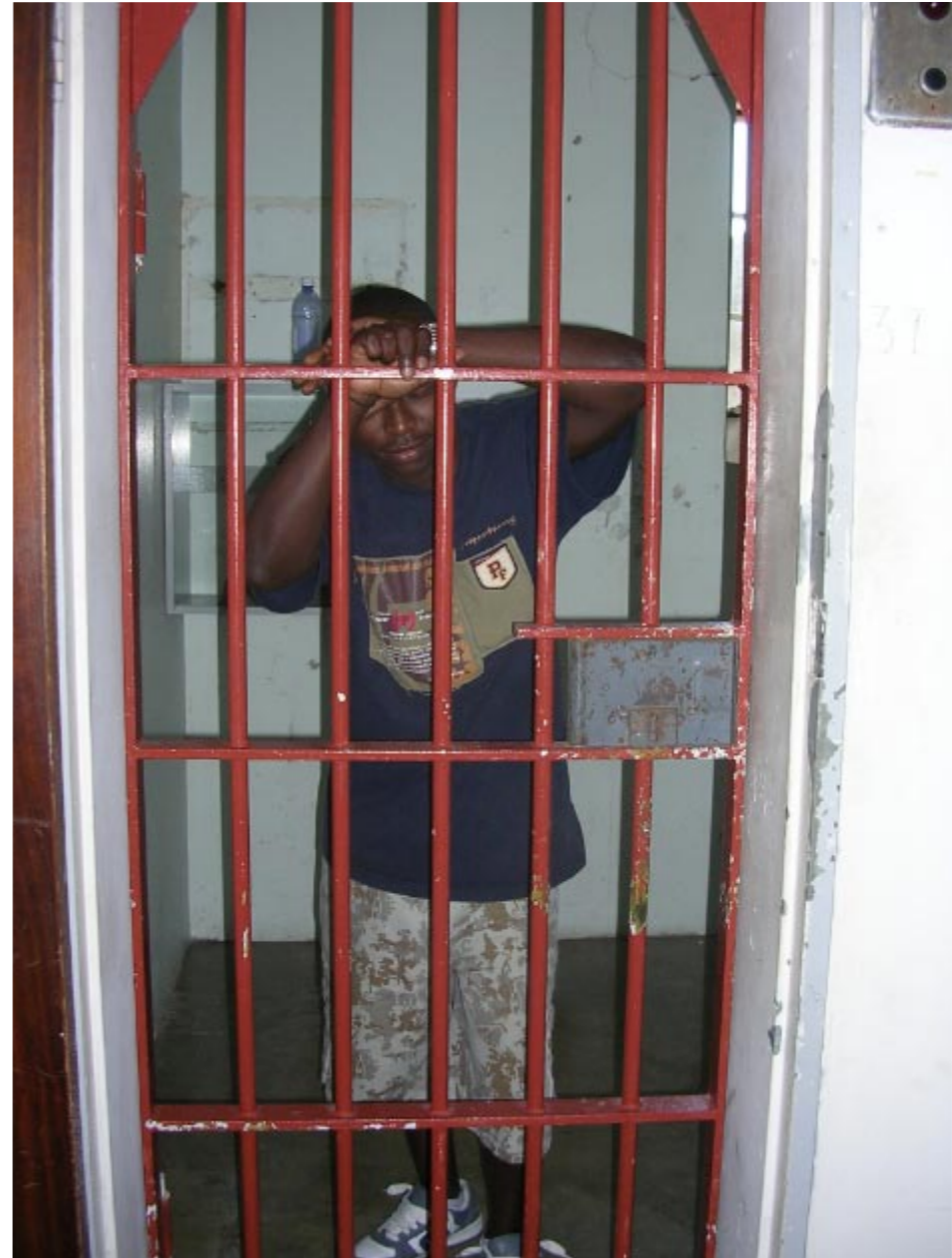
Chaba in a Robben Island Prison Cell