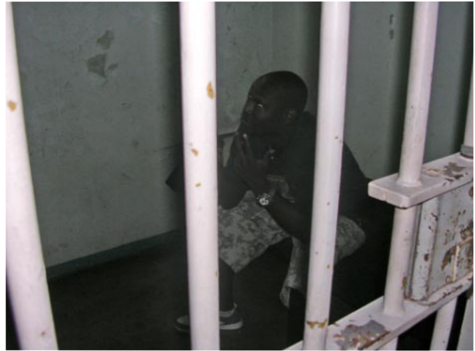
Me in a Robben Island Prison Cell