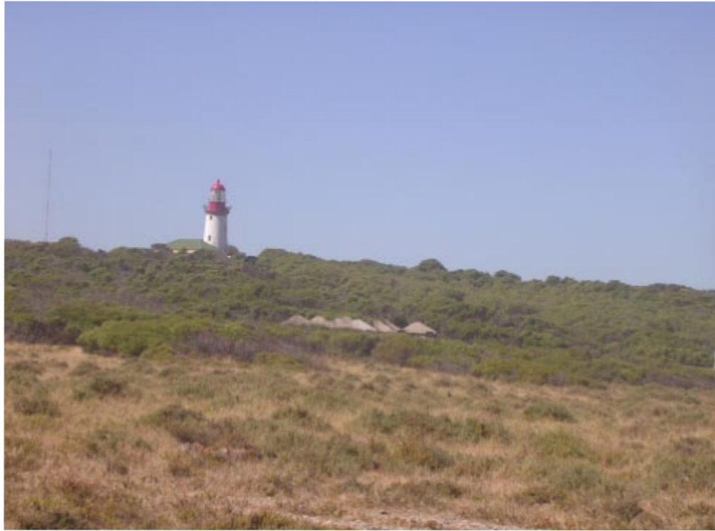
Lighthouse on Robben Island