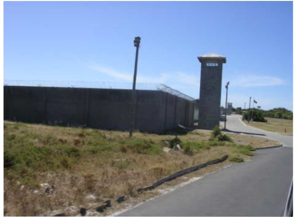
Robben Island Prison