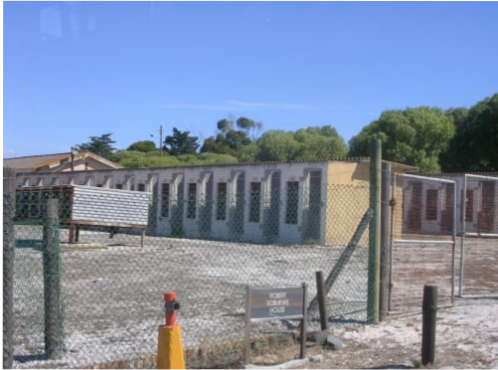
Dog Kennels for Dogs at Robben Island used on prisoners