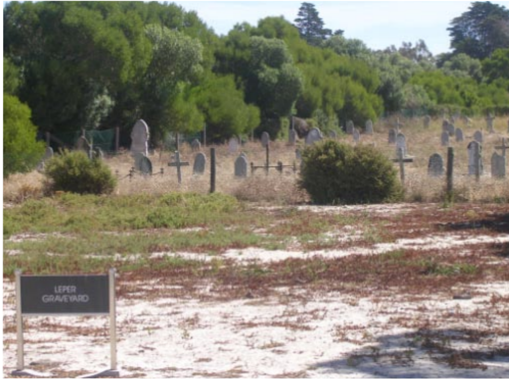
Leper Graveyard on Robben Island