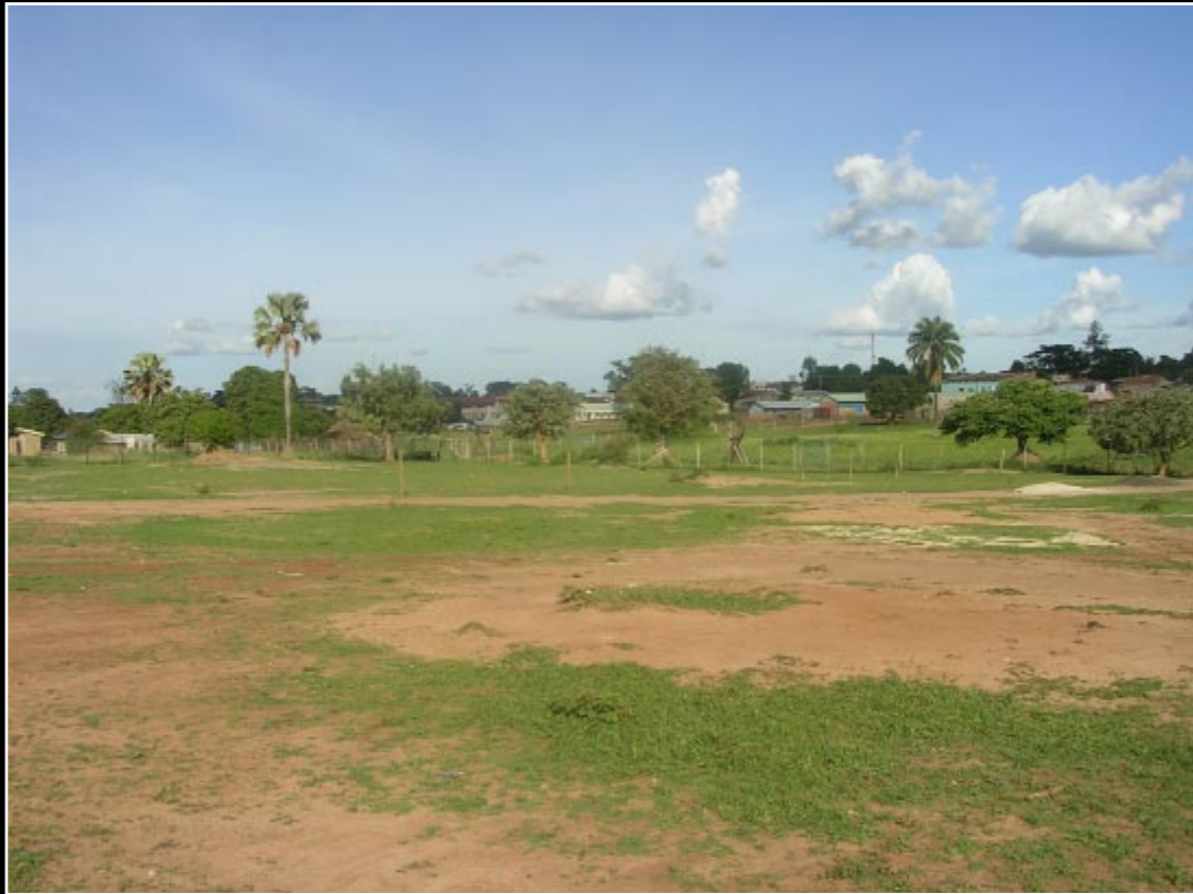
Land where 30,000 street children sleep nightly