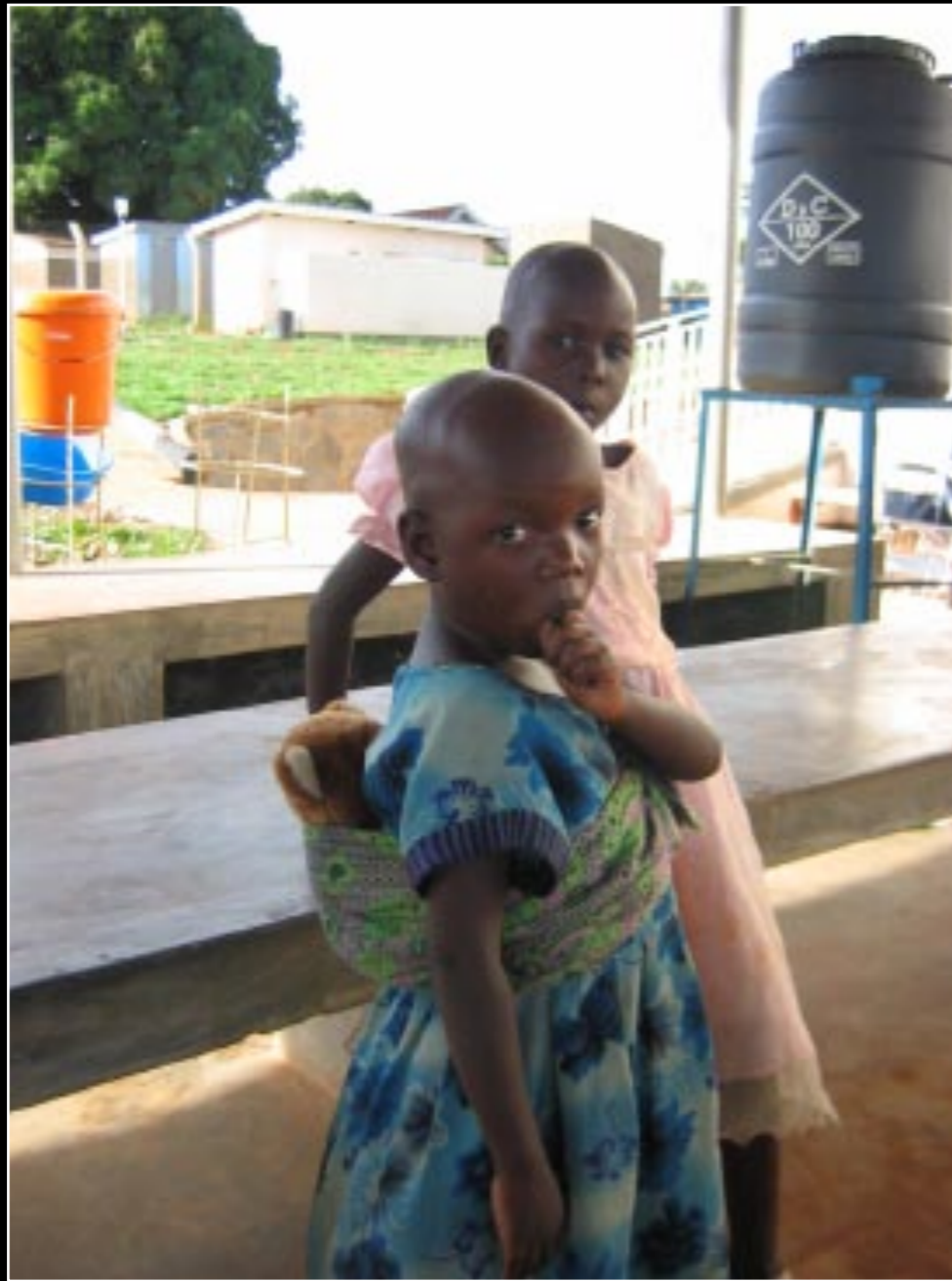
Carrying her baby teddy on her back!