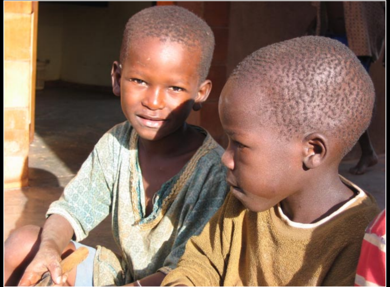
At SOS Children's Village