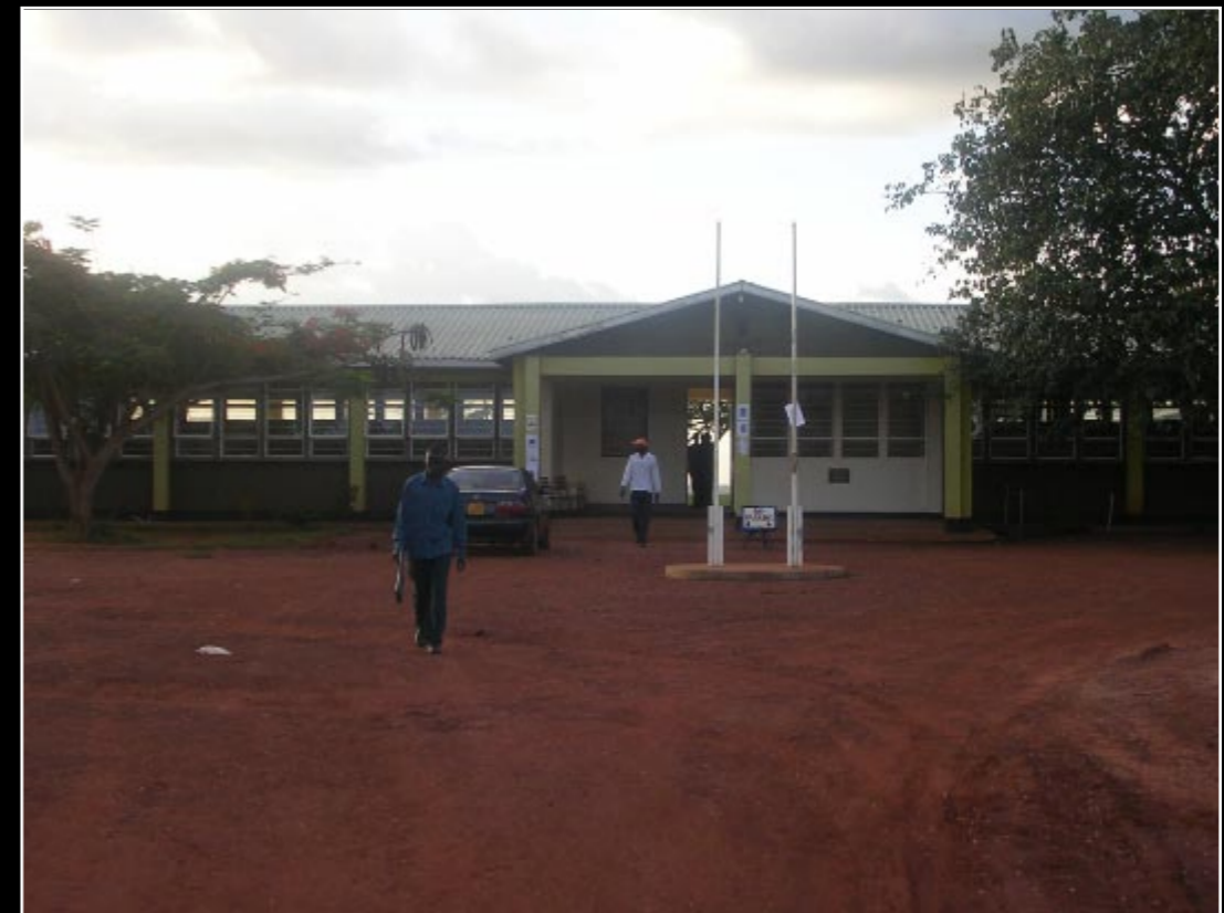
Gulu University Main Campus