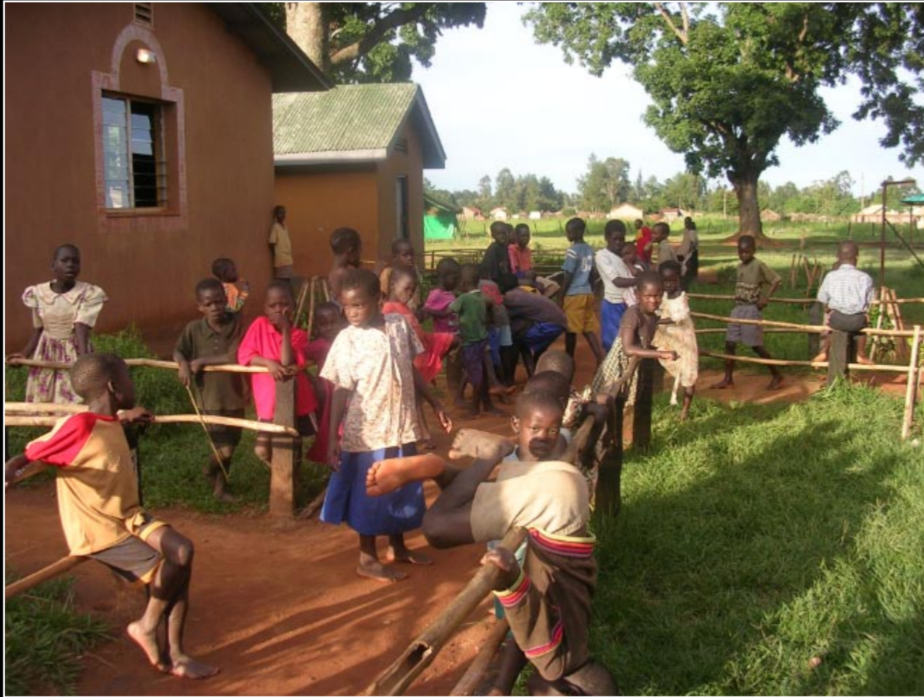
Entering SOS Children's Village