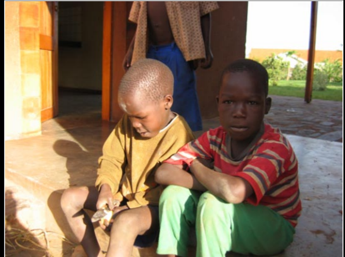
Big knife for little boy!