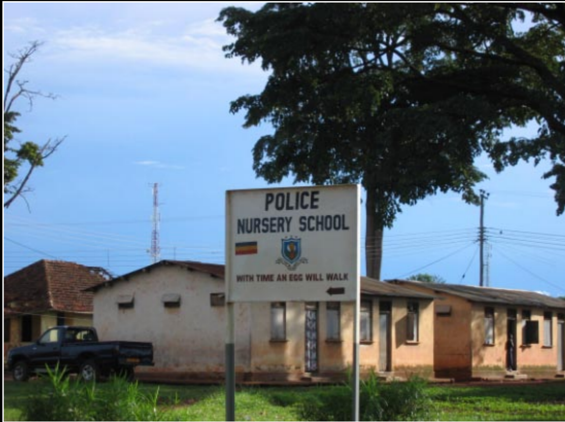
Read caption at bottom of sign