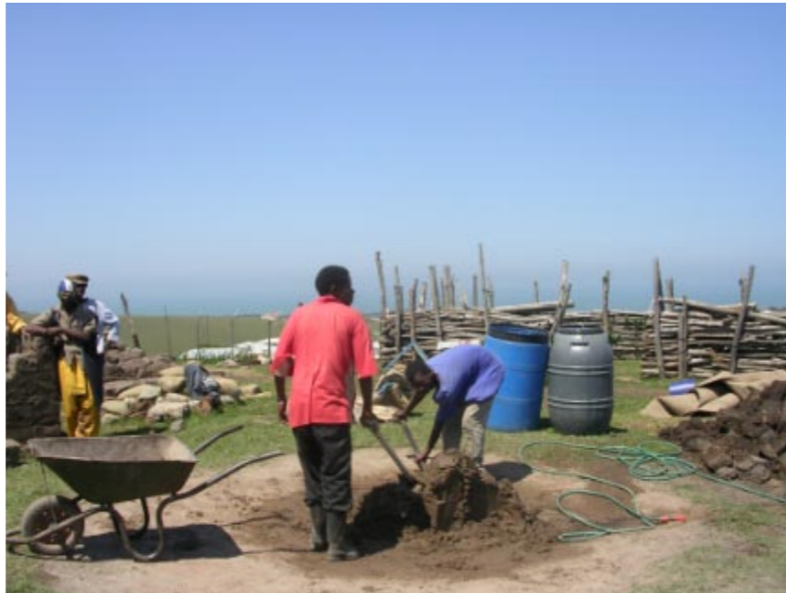
Mixing cement to use in between mud bricks