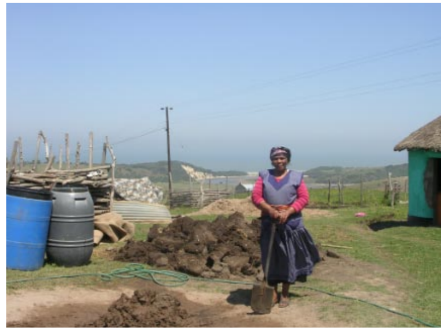
Woman of the village with Transkei countryside and ocean