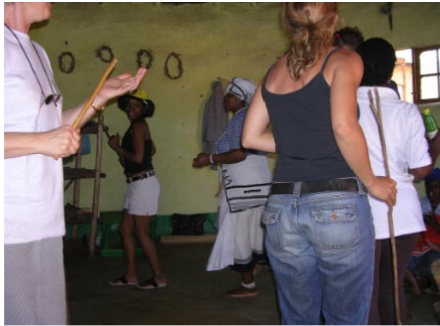
Dancing before the ritual drinking of herbs