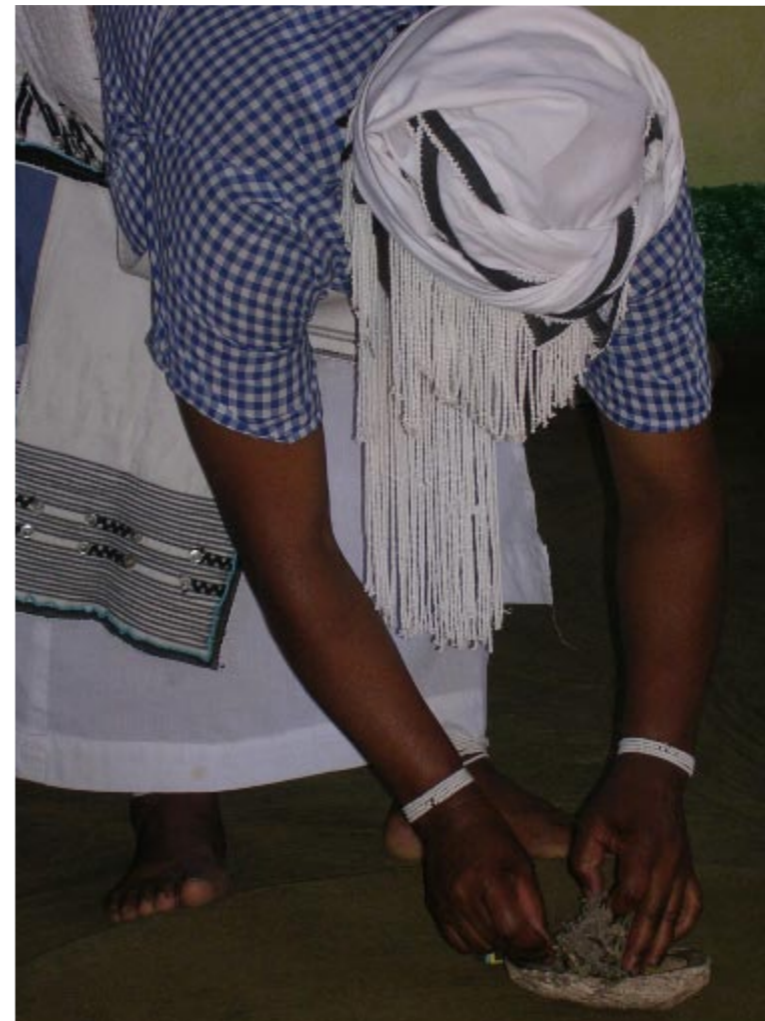
Lighting herbs to keep away bad spirits