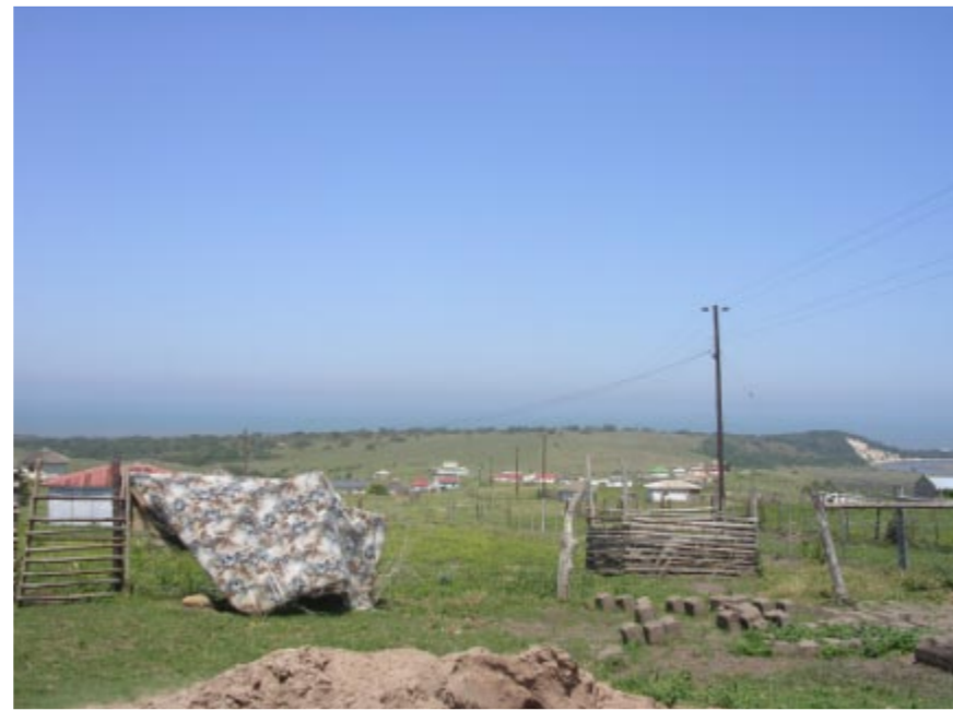
View of next village