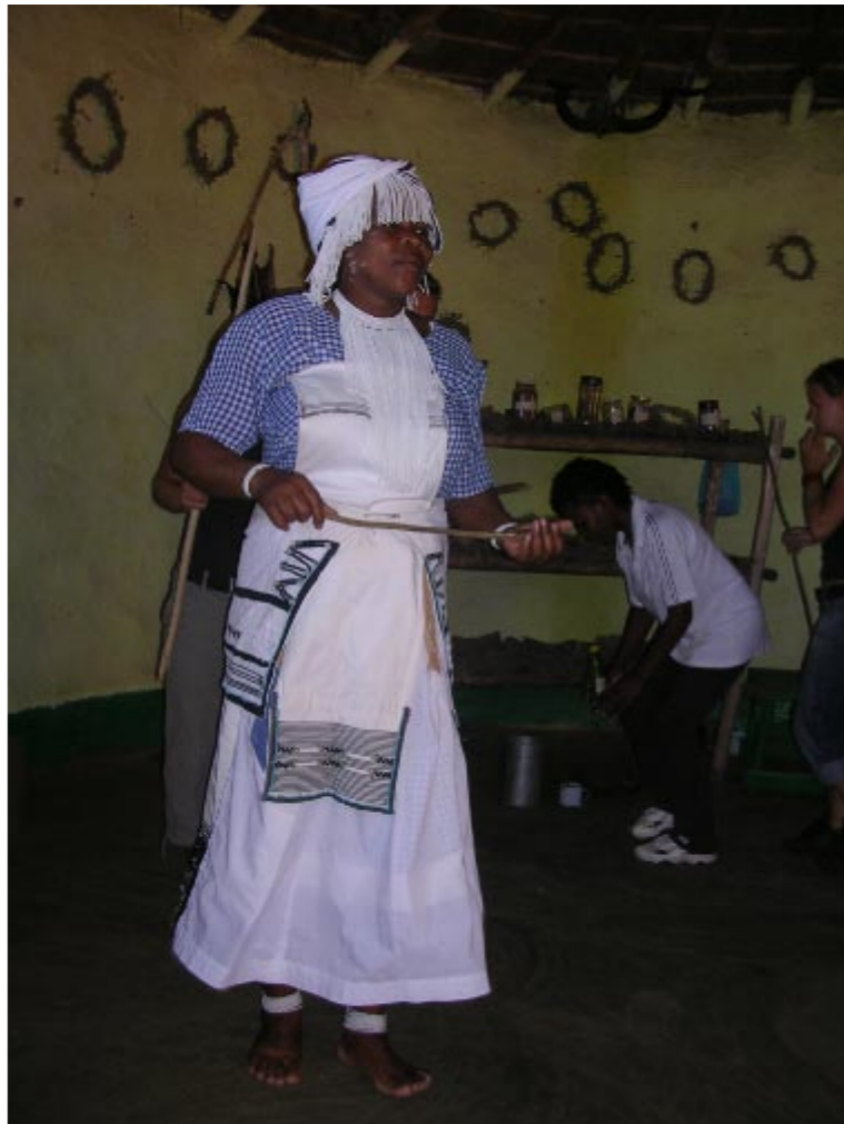
Sangoma (witchdoctor) dancing