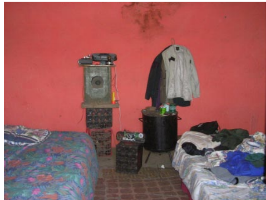
Inside of traditional Xhosa Rondoal