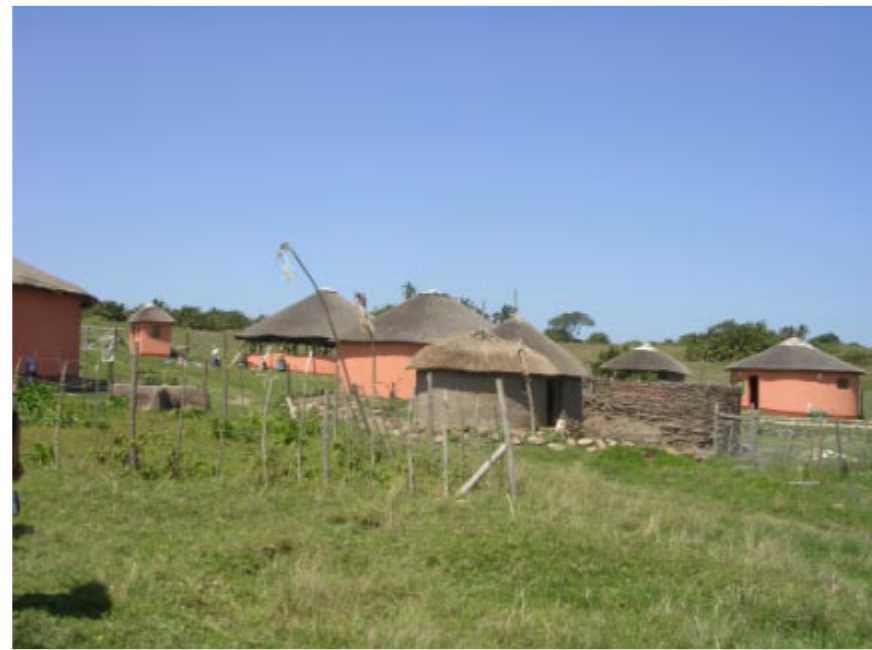
Rondovals in traditional Xhosa Village