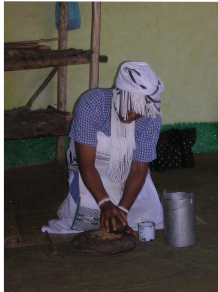
Sangomoa preparing drink to cure headache