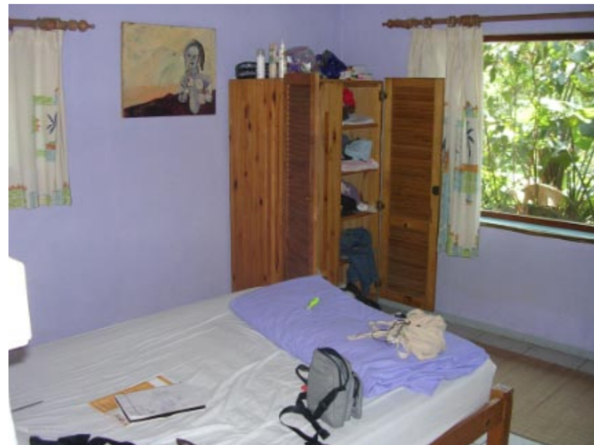
The room I shared with Mr. Gecko at Bucanners Backpackers