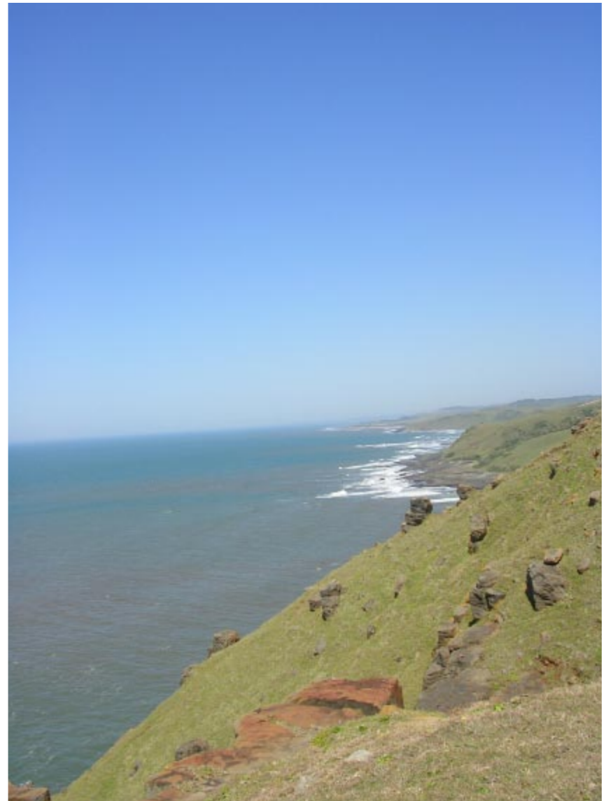
Transkei Coast, South Africa