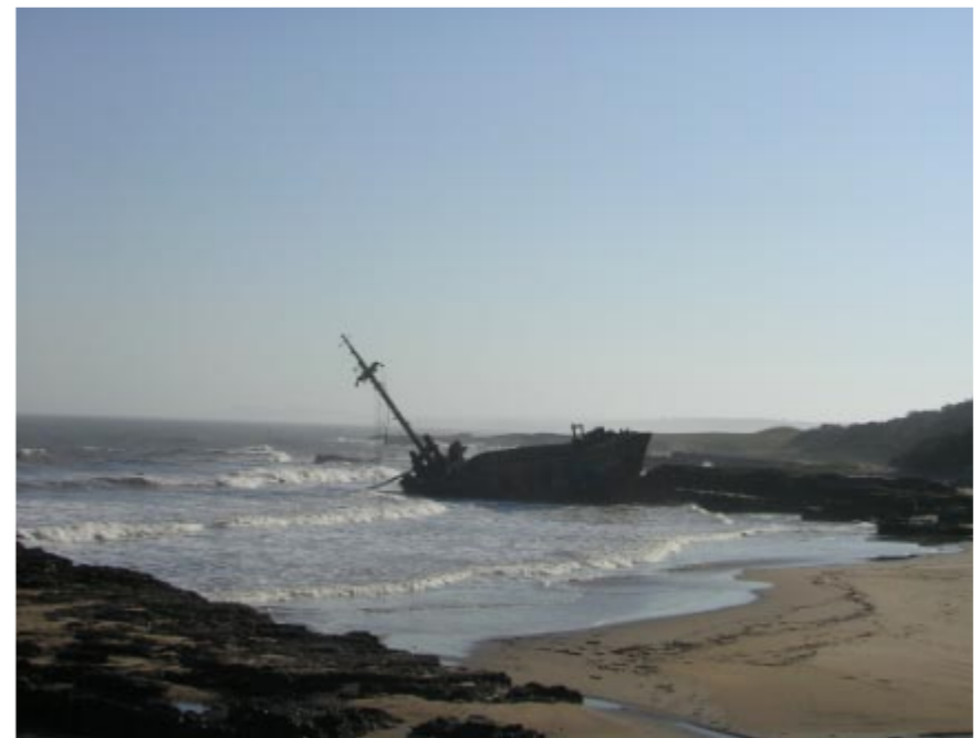
Jacaranda Shipwreck, 1971