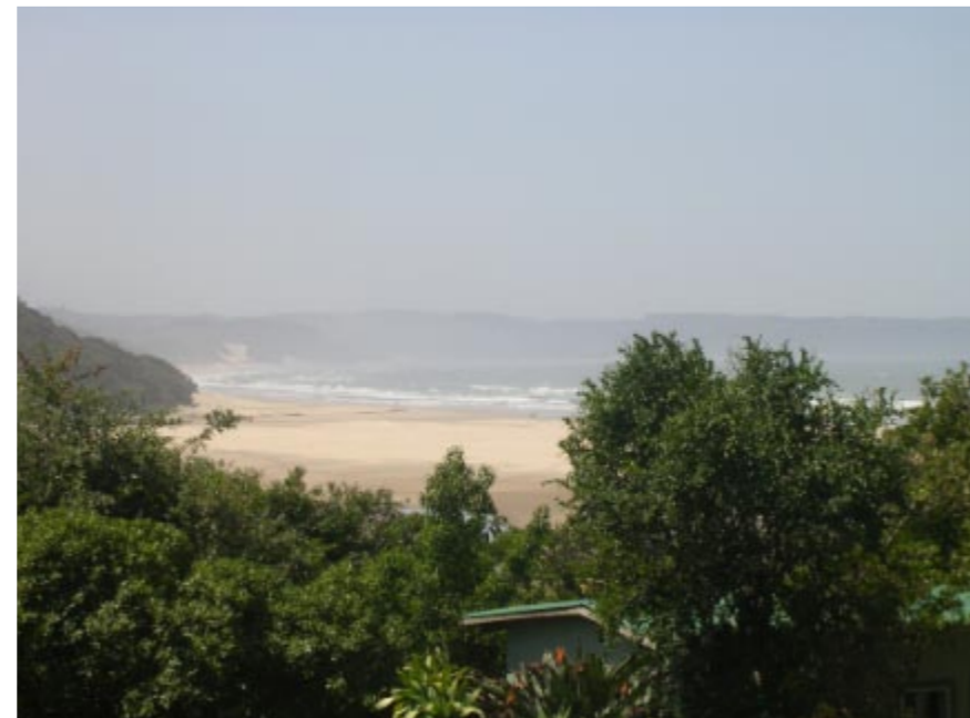
View from porch of cottage at Bucaneers Backpackers