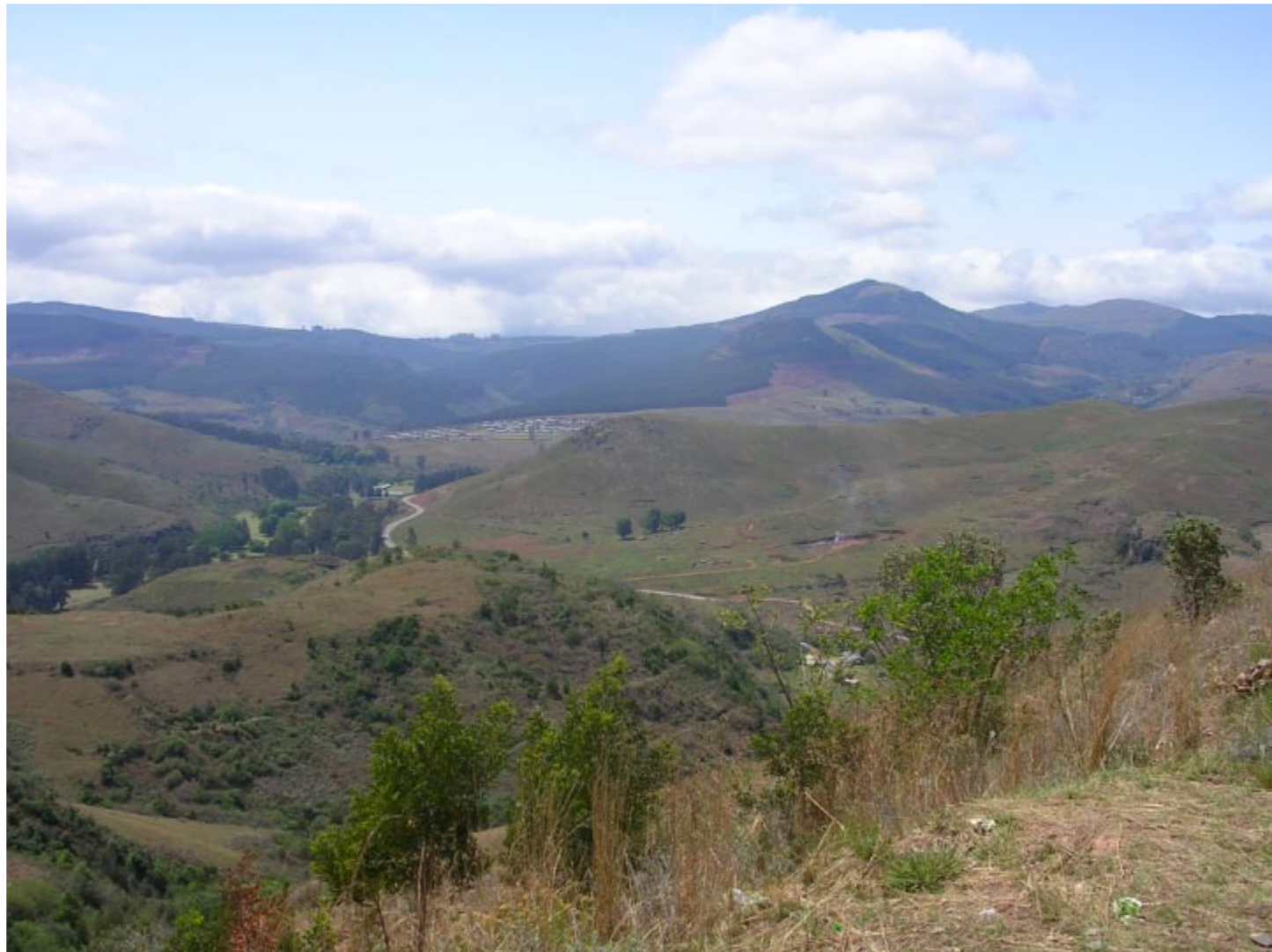
Mpumalanga, South Africa