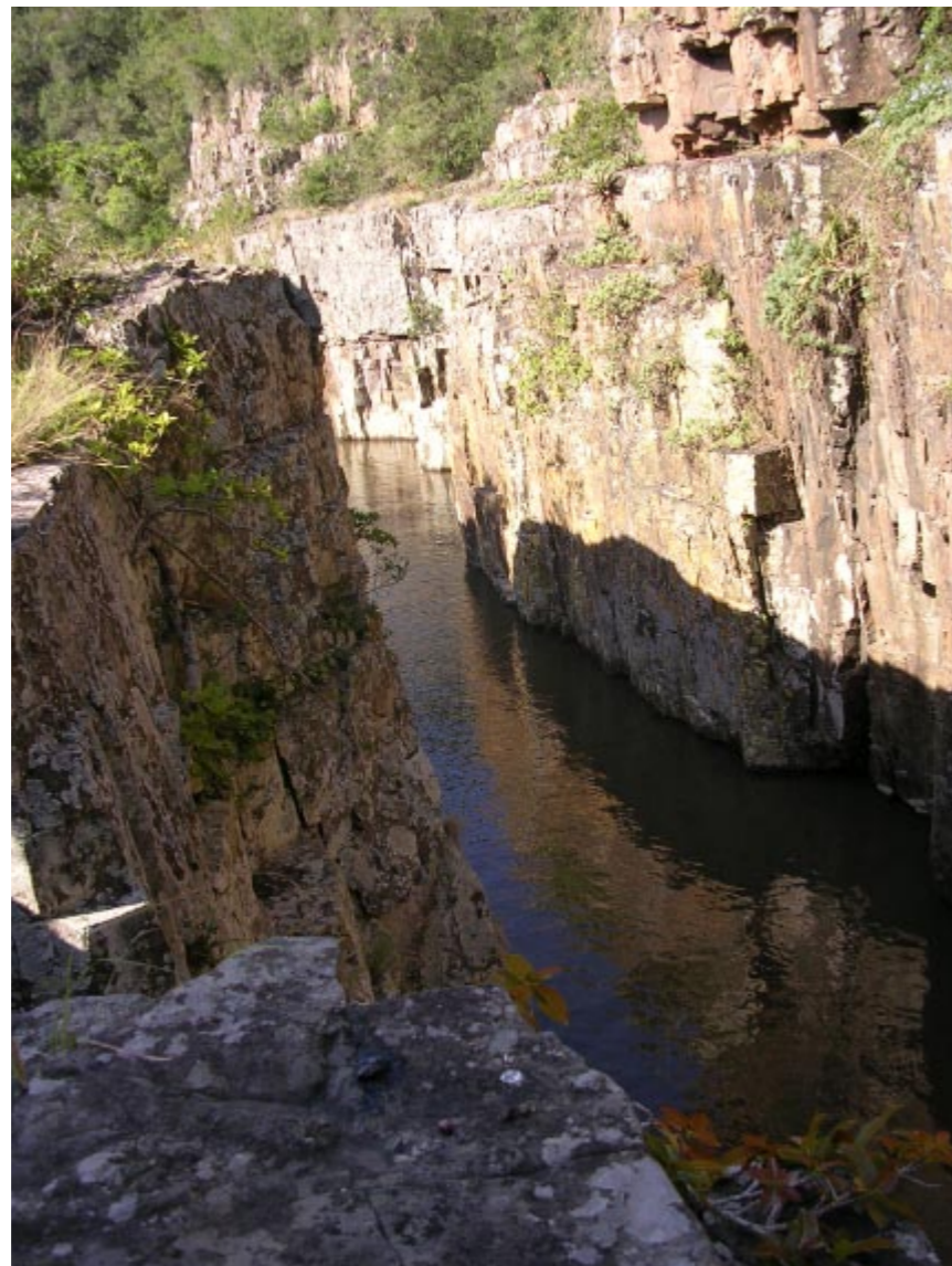
First Cliff I Jumped from when 'learning' to cliffjump!