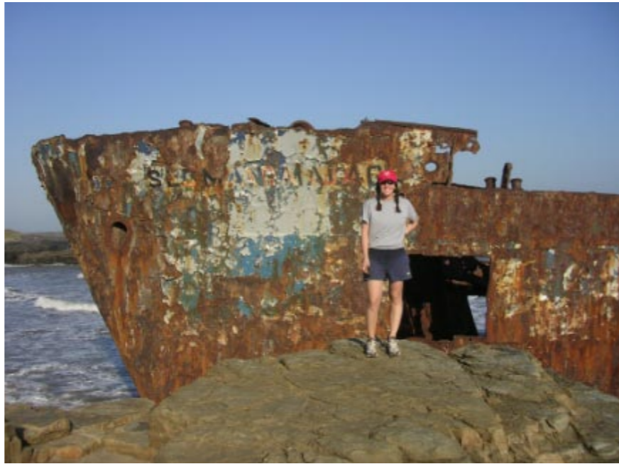
Standing in front of the mysterious Jacaranda shipwreck