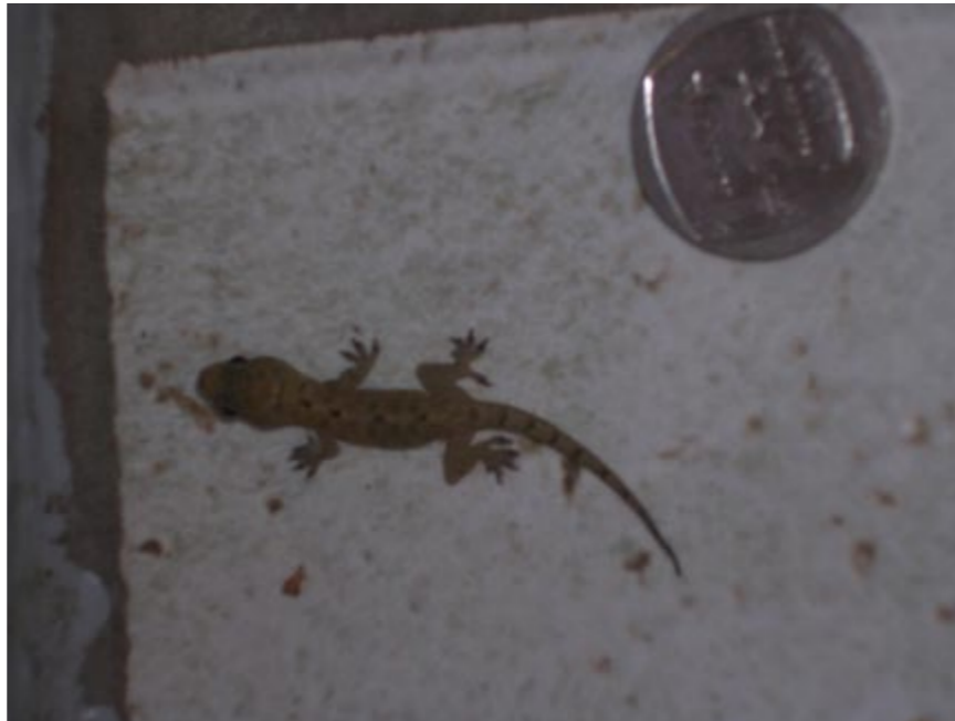
Mr. Gecko, next to a 1 Rand coin. He slept on my pillow!