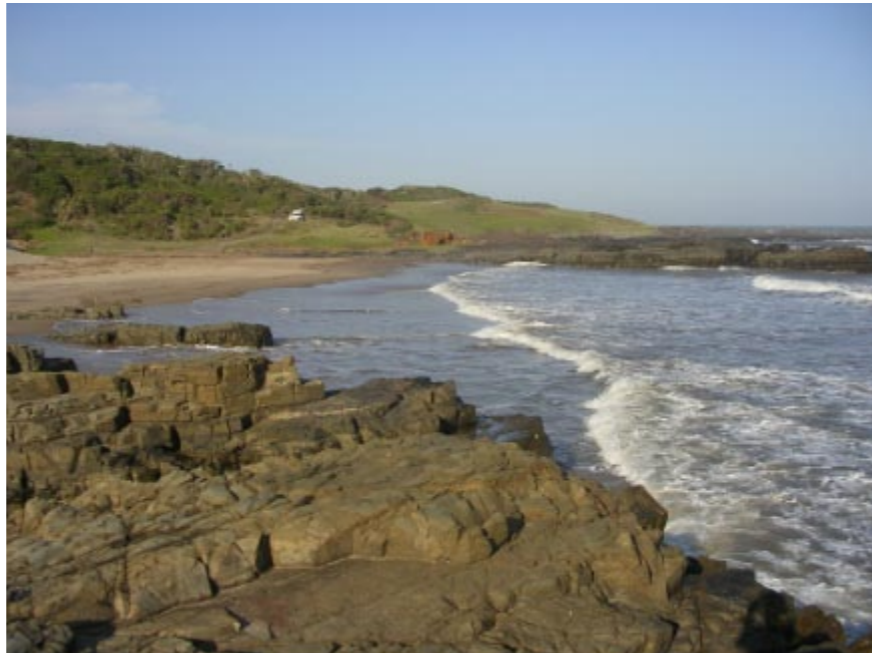
Wild Coast, South Africa