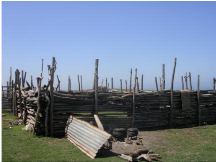
Stew for dinner and Kraal for cattle