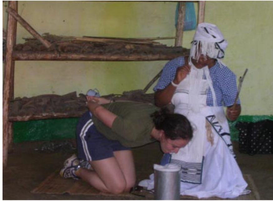
Drinking concoction made by the Sangoma (witchdoctor)