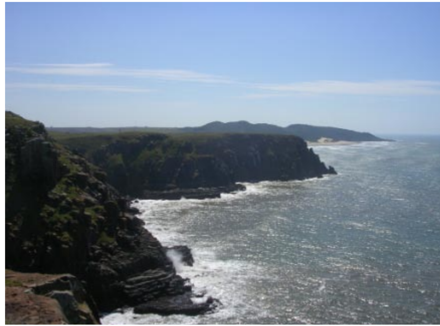
Transkei Coast, South Africa