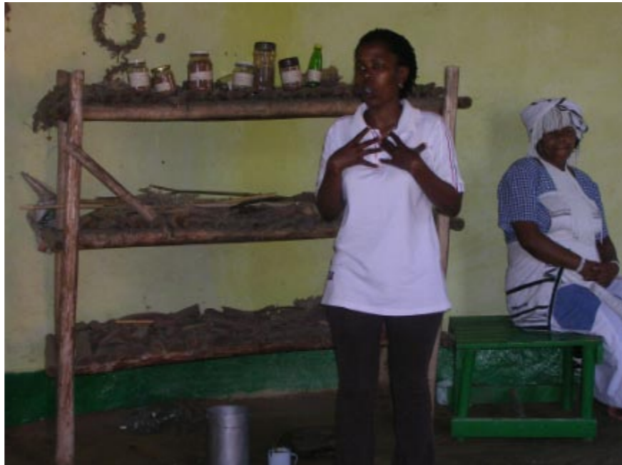
Herbs on cabinet used by Sangoma