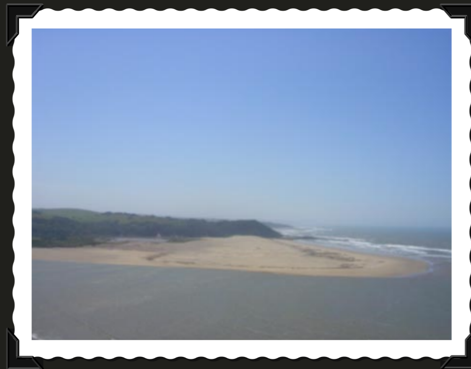
Waiting to cross bay by ferry- there is no bridge