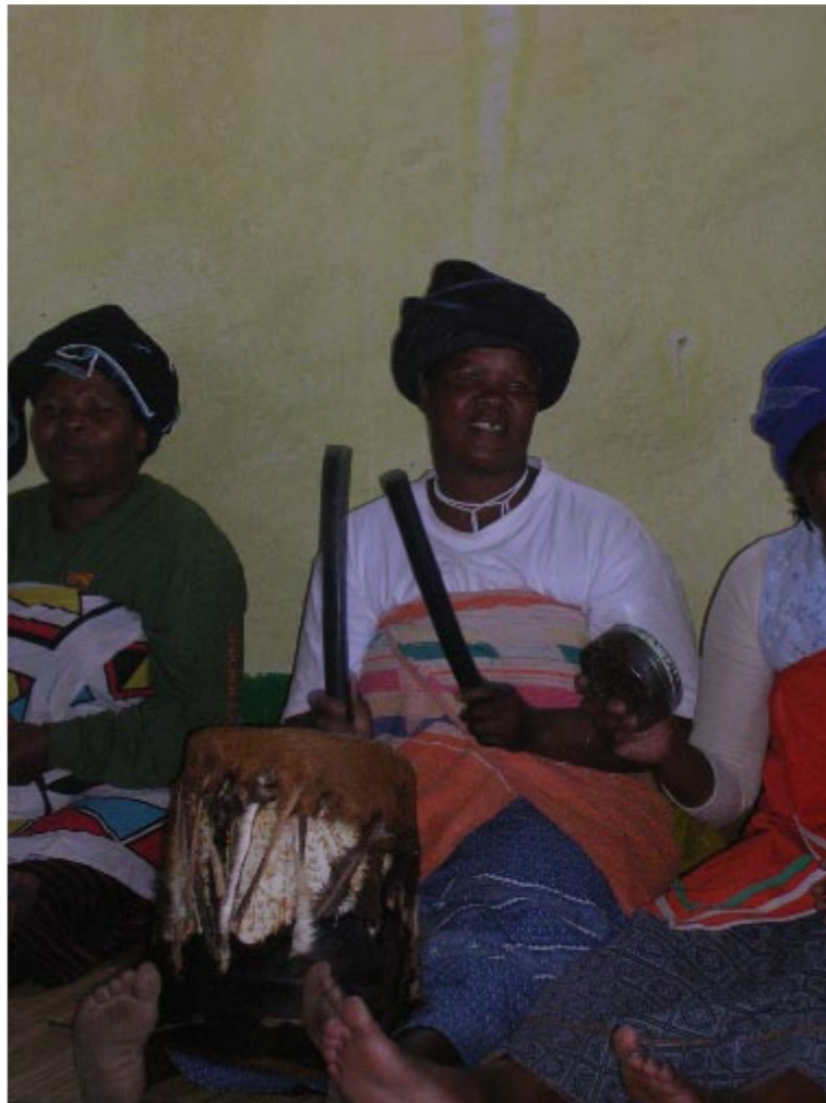
Providing drumbeat during Witchdoctor ceremony