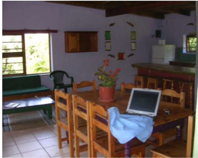
Living Space at Bucaneers Backpackers, Cintsa, South Africa