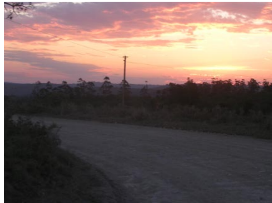
Typical African Sunset