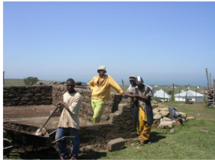
Buiding a house in a Xhosa Village