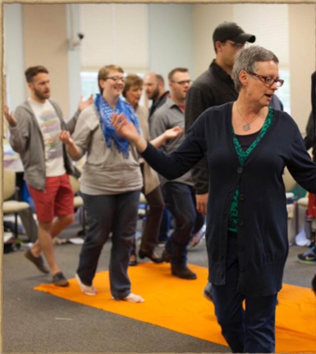
Walking the path while singing Ps. 37.5.