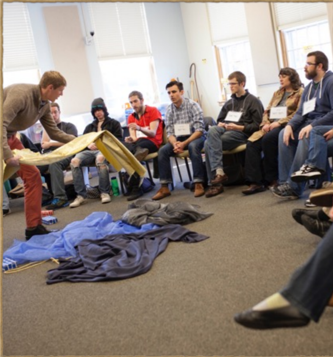
Visualizing Genesis 1 together