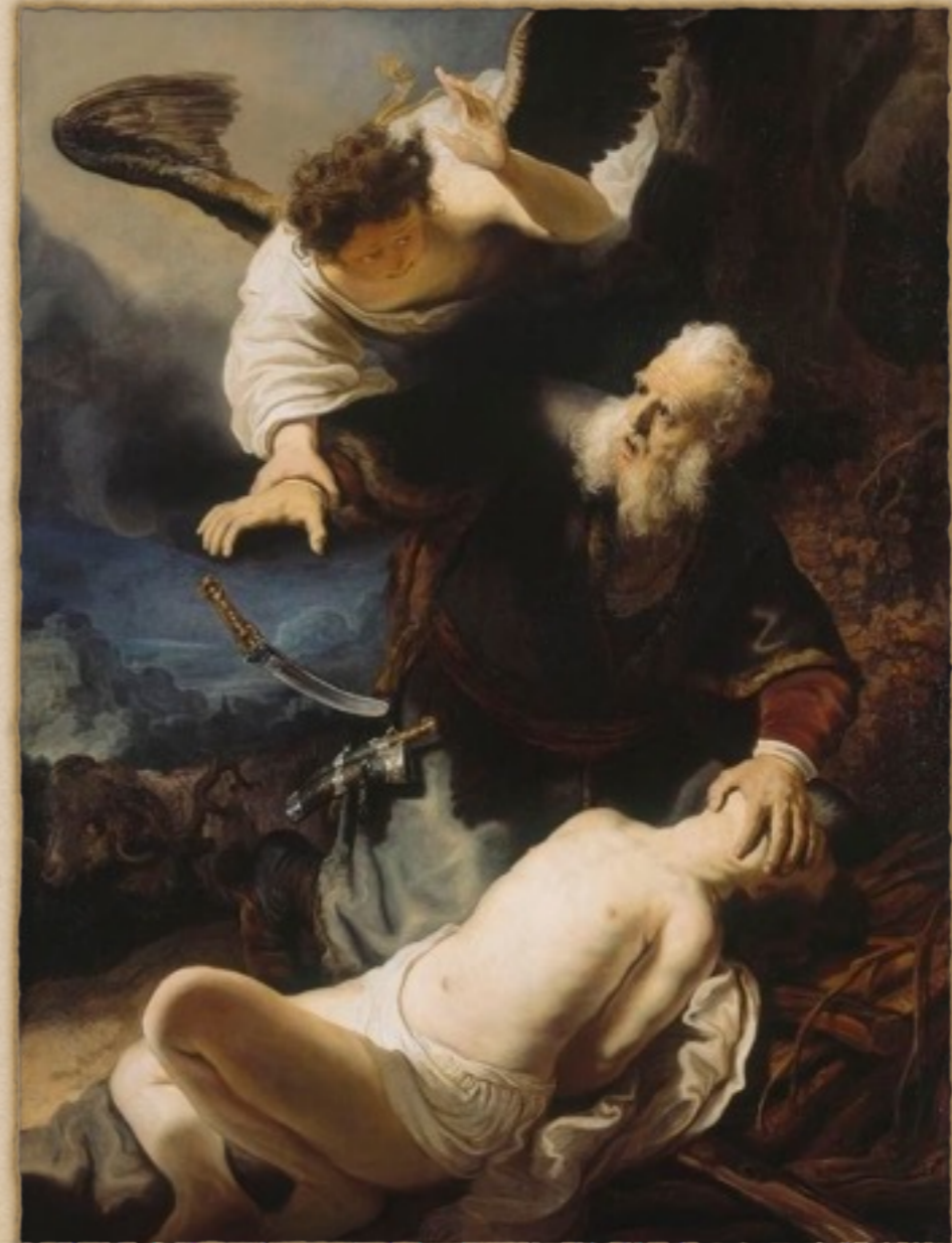
Abraham and Isaac, Rembrandt 1634