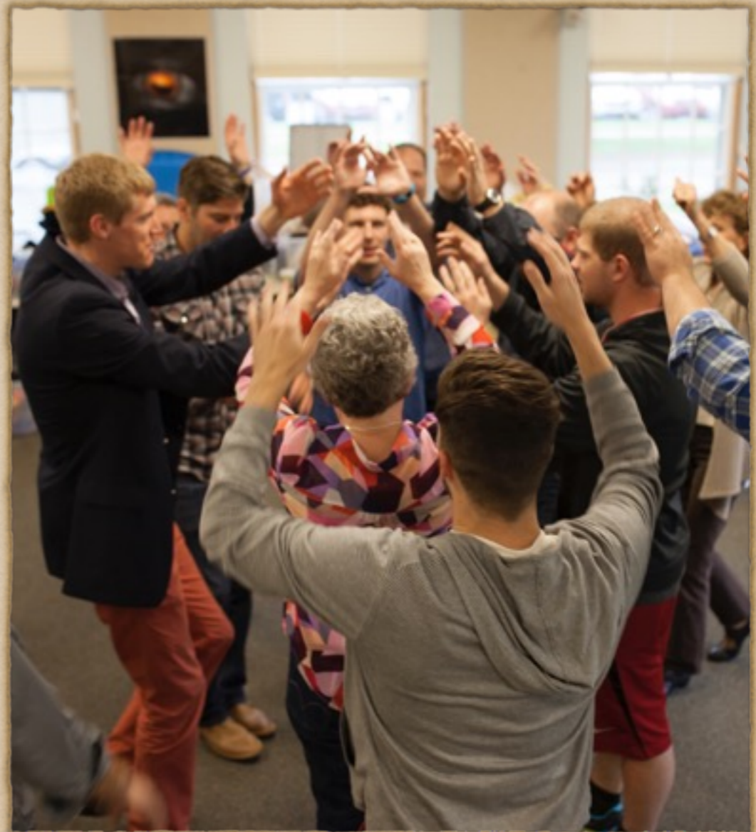
Singing the “mayim” song!