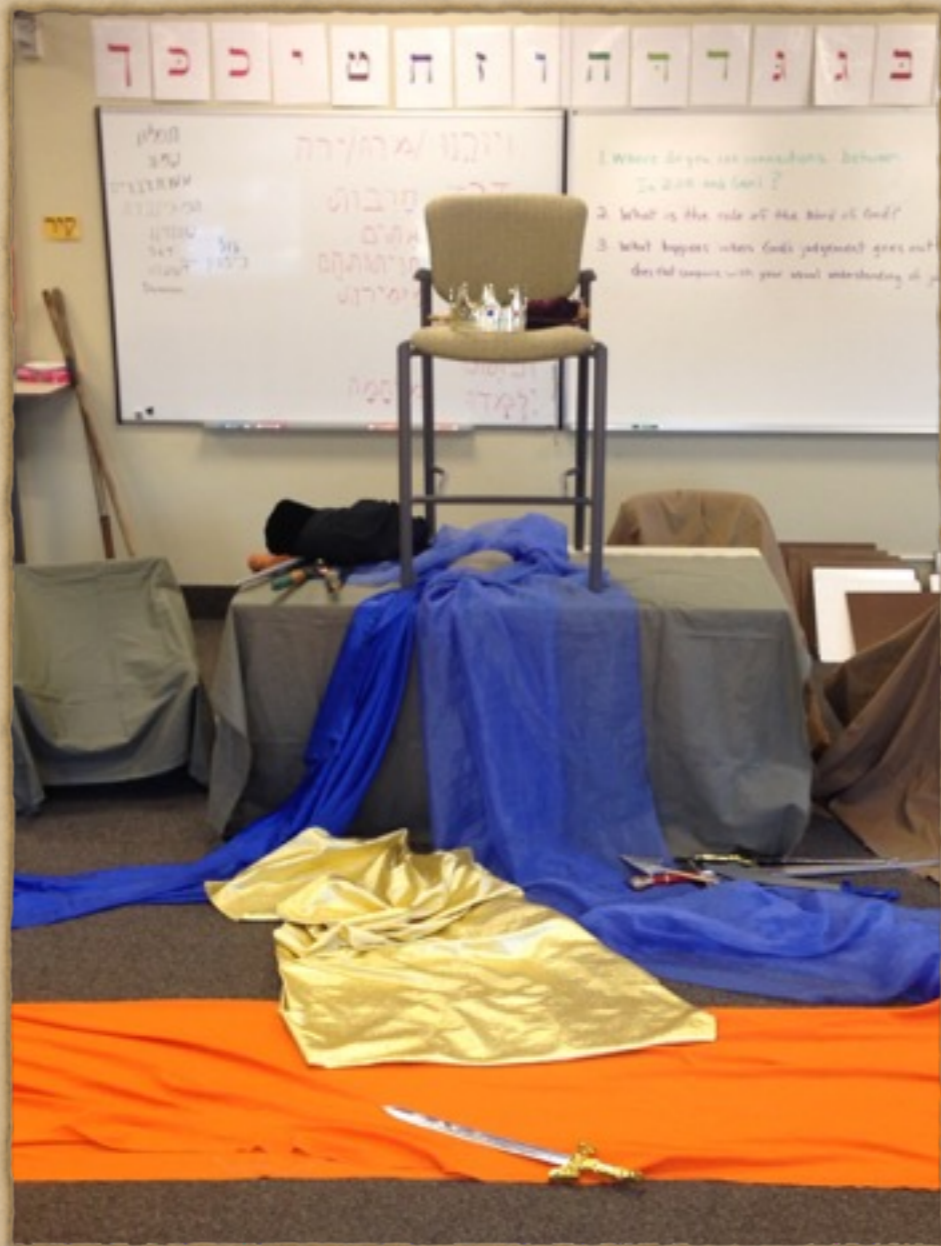
Visualization of Isaiah 2.1-5