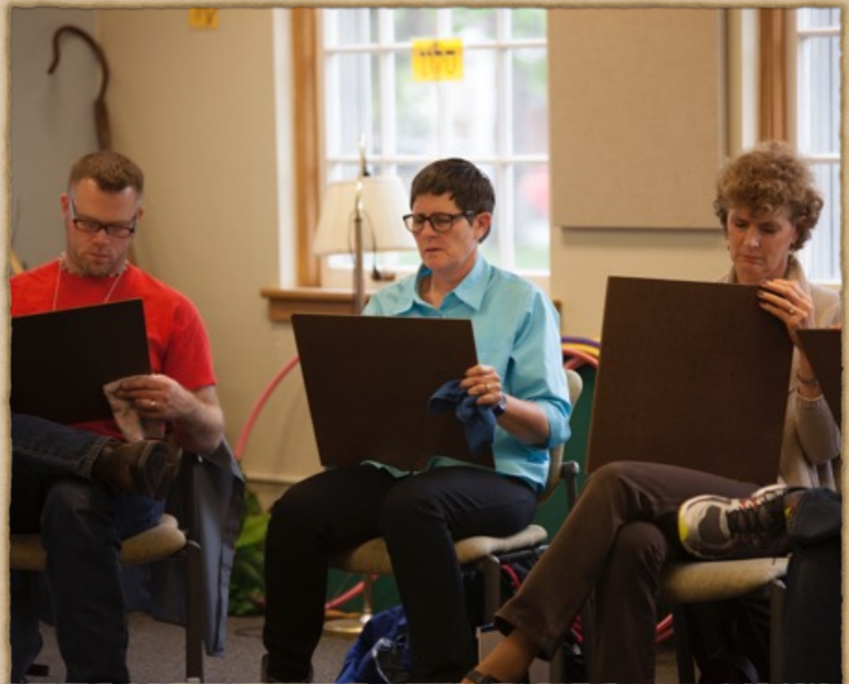
Practicing writing and verb drills on lap boards.