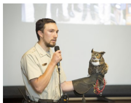
March—"Radnor Lake State Park"