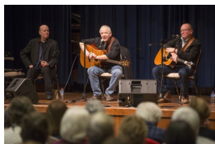
January—"It All Begins With a Song"

We had three very successful Lunch and Learn events during the spring term: "It All Begins With a Song", "Radnor Lake State Park", and "How Metro Council Works". Here are some photos from the events and stay tuned for announcement for fall dates.