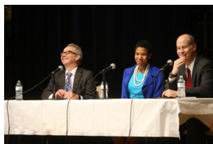
April—"How Metro Council Works"