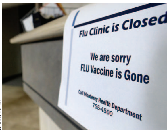
MARY ORVILLE MYERS

"The usual mode is for investigators to pick a narrow area and to become evermore expert," says Schaffner. "I've done the exact opposite. I've taken a discipline—epidemiology [the study of the causes and transmission of diseases within a population]—and I've applied it broadly and almost exclusively to issues of communicable diseases and how they occur in the community or among patients in our hospital. Also, the prevention of those communicable diseases, particularly through the use of vaccines, has evolved into another preoccupation of mine."