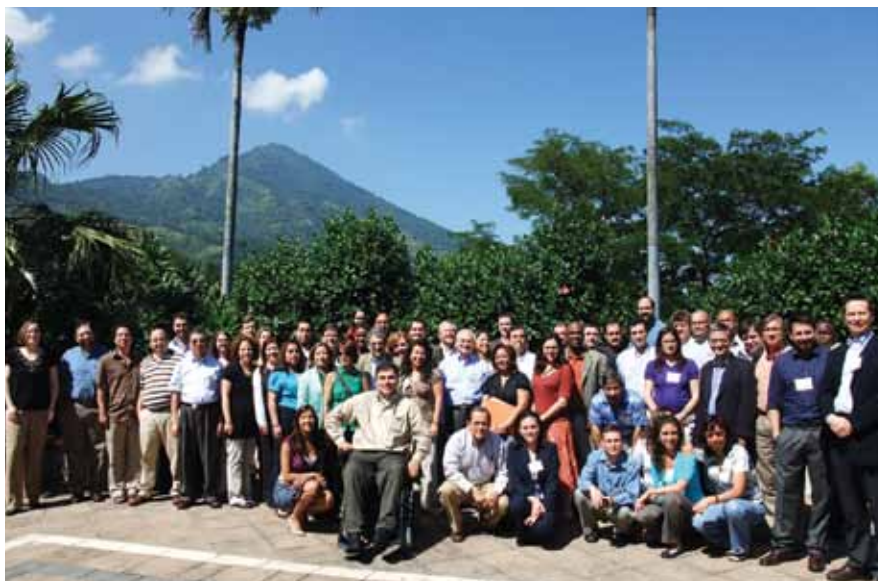
Country teams, LAPOP staff, and donor representatives gathered in San Salvador to launch the 2010 round of survey research.