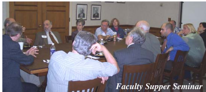
Faculty Supper Seminar