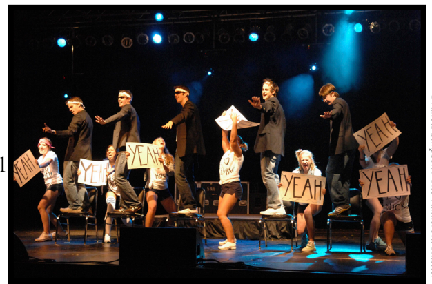
Members of the Blue Circle perform their winning routine to the Backstreet Boys hit "Everybody" at the Thursday Lip Sync competition.

Events began on Sunday with a community church service attended by members of the NPHC fraternities and sororities. On Monday, September 8 the council held Greek Mystique, an informational meet-and-greet with all the fraternities and sororities of the council. This was the first time ever that all nine NPHC organizations participated in Greek Mystique. Having Sigma Gamma Rho Sorority and Iota Phi Theta Fraternity alumni present gave a strong unified showing of the black Greek-letter organizations available to interested students. continued on pg. 4