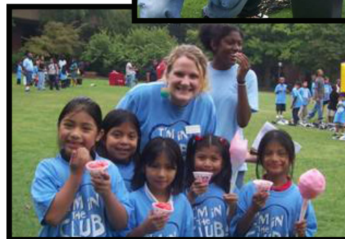
Students from the Boys & Girls club enjoy the Play Day activities during NPHC Week with members of the fraternities and sororities.