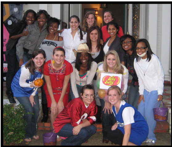
Members of Chi Omega, Alpha Kappa Alpha, and Lambda Theta Alpha sororities get ready to receive the trick-or-treaters.

Trick-or-Treat with Greeks and Athletes had an incredible turnout and provided a safe and fun atmosphere for students, faculty, staff, and their families. The activities provided a great opportunity for the Vanderbilt community to come together, and to see the Greek and Athletic students unite for a common cause. ♦