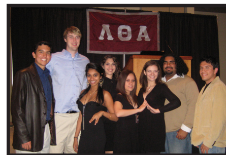
Members of Lambda Theta Alpha Latin Sorority, Inc pose with contestants from the chapter's annual 'Mighty Man' Service Auction.

Zeta Phi Beta Sorority Inc. hosted their annual philanthropy, Zeta Night of Soul on November 5, 2008. The event benefits Project ZEAL, which contributes to the Boys and Girls Clubs of Middle Tennessee. The chapter had a great turn out for the Broadway themed extravaganza. There were appearances from Elle Woods and her Bend and Snap crew (Pi Beta Phi), Sharpay and the High School Musical gang (Alpha Delta Pi), and of course the Dream Girls (Zeta Phi Beta). This year's proceeds will build bookshelves at a local Boys and Girls club. ♦