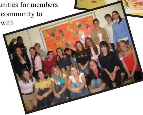
Sorority members pose after volunteering with Monster Mash (left). Lower Murrell student colors fall-themed art during the day's activities (above).