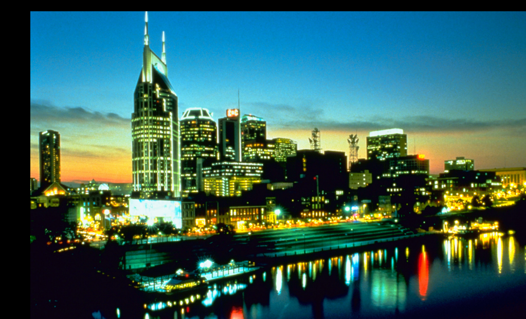
Fisk and Vanderbilt are located in Music City USA (Nashville, Tennessee).