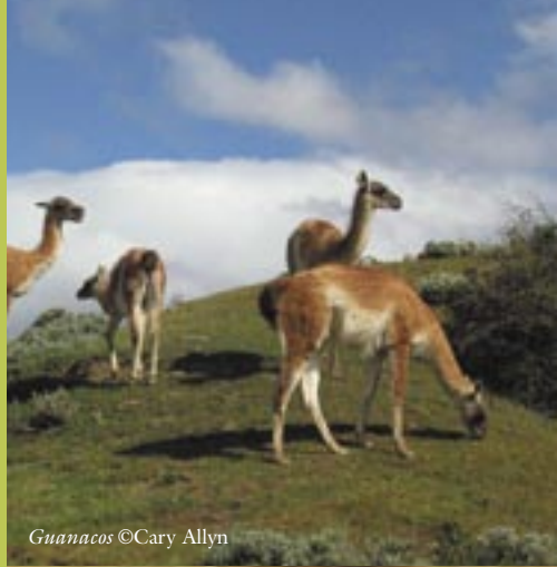
Guanacos